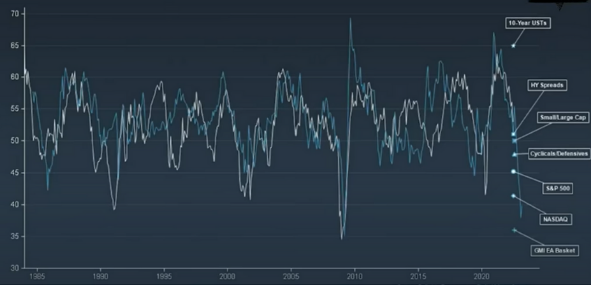
Global Macro Insider Financial Conditions Index (9 Month Lead) - US ISM Manufacturing PMI

In the table below, Global Macro Insider (GMI) has calculated their proprietary financial conditions index, which historically leads the US ISM PMI by about nine months<sup>(4)</sup>. It is pointing sharply downwards, suggesting that the US PMI will fall below 45 in the next several months and below 40 by early next year, suggesting a sharp U.S. recession is coming. Interestingly the indicator has turned and is starting to move higher again, suggesting that the U.S. economy will bottom in about eight months, so about March of 2023. Equity markets typically bottom 3-6 months before the real economy bottoms, suggesting the equity market bottom is nearby. Equity markets also tend to bottom when inflation peaks, which is about now in our view.